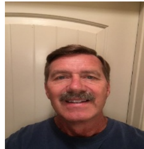
Grand Knight Council 8306

God bless, and I hope to see you at the March 13 th meeting.